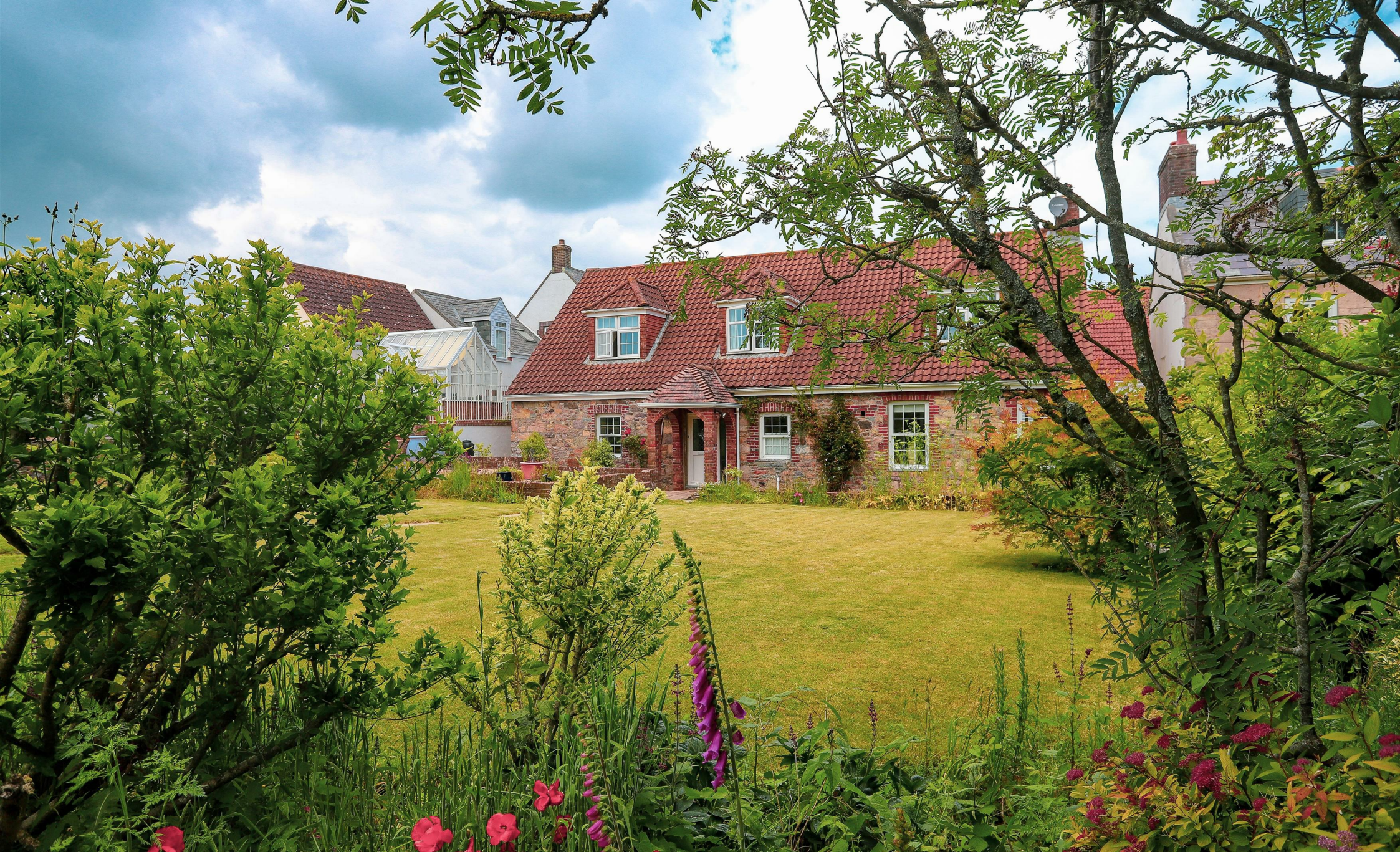
Jardin des Fleurs La Rue Du Huquet, St Martin, Jersey, JE3 6HE £1,695,000